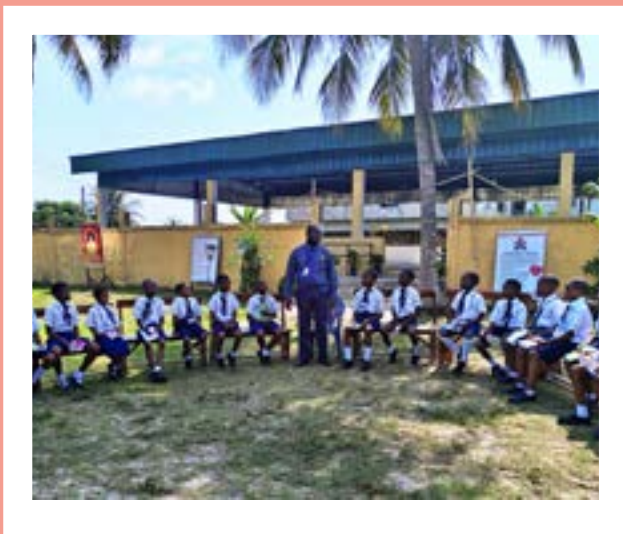
TRANSFORMATION CLUB (Sathya Sai School Lagos)

The recordings of all sessions can be found at: http://videos.educaere.org/